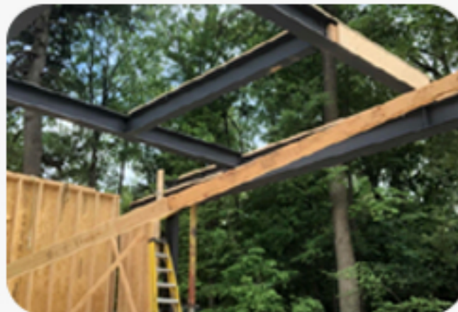
06/07 | 01:38PM