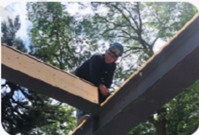
06/07 | 01:38PM