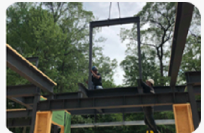
06/07 | 01:38PM